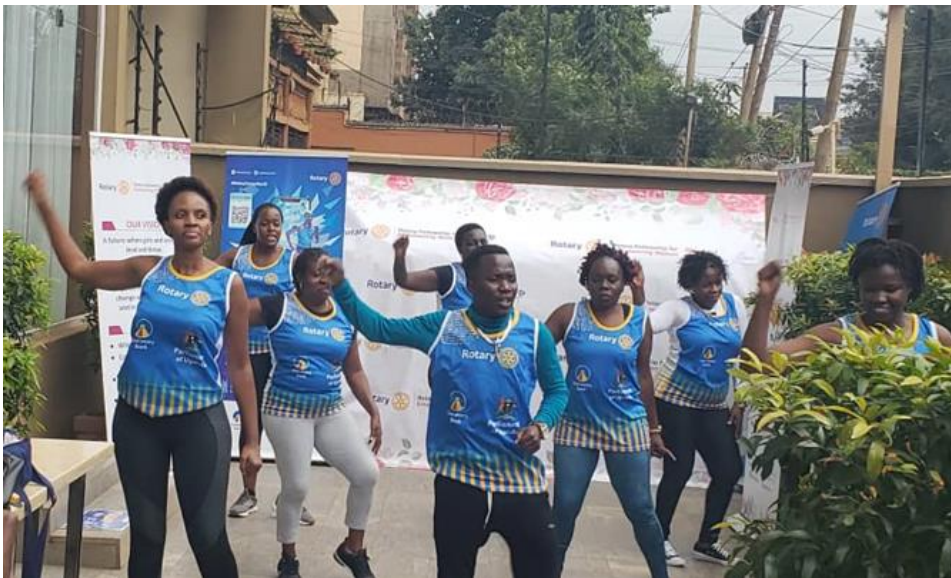
PR activities supporting the Cancer run