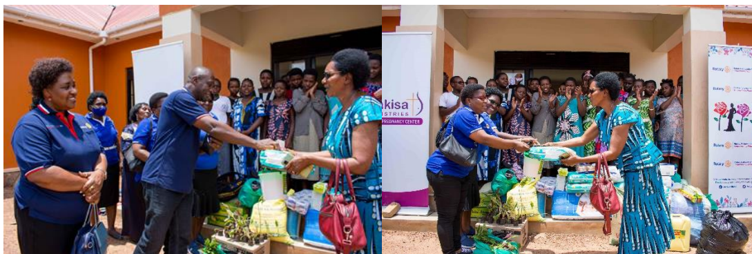
Women’s day activity at Wakisa Ministries