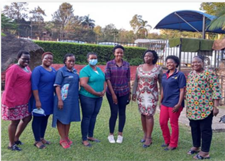
RFEW Strategic Team pose for a photo after the Strategic Planning Retreat – File photo